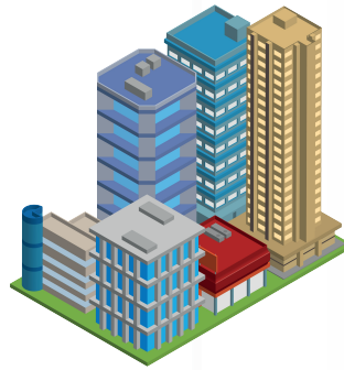
Manage your roofing Portfolio